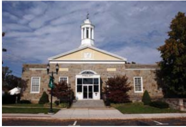
The Historical Society of Harford County, Inc., headquarters.