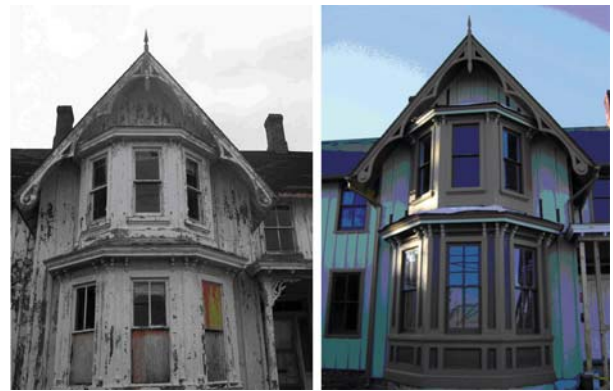
Proctor House before (left) and after (right) - Gordon Street, Bel Air, Maryland

A highlight in Harford County this year is the restoration of the Proctor House, the only non-religious Carpenter Gothic building within the Town of Bel Air. Built between 1860 and 1873 and enlarged in 1879, the house stayed in the Proctor family until acquired in 1965 by the Harford County Board of Education. In 2007 the Board abandoned the Gordon Street house, which remained vacant and deteriorating until its purchase in 2010 by the Kelly Group for use as additional office space.